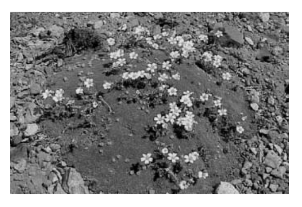
Fig. 1 An Azorella monantha cushion invaded by flowering individuals (white flowers) of Cerastium arvense.

© 2007 The Authors Journal compilation © 2007 British Ecological Society, Journal of Ecology , 95 , 682–688